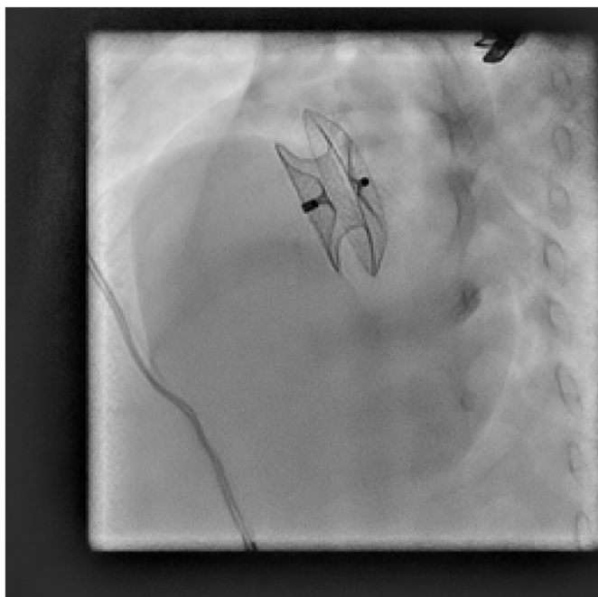
Fig. 1. 8 months old male child weight 5.8 Kg, 72 cm - 15 mm device.

We had 98 % (145/148) success rate in implanting ASD device in these small children with no major complications. We selected the