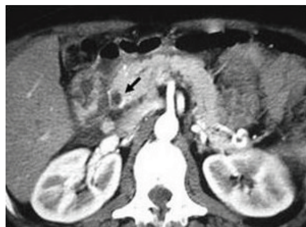
Figure 1 Computed Tomography scan after four months in case 1. Lesion found in the head of the pancreas (arrowhead).

The carbapenem non-susceptible isolate was initially characterized by the Phoenix system (Becton Dickinson, Sparks, MD, USA) as resistant to amikacin and