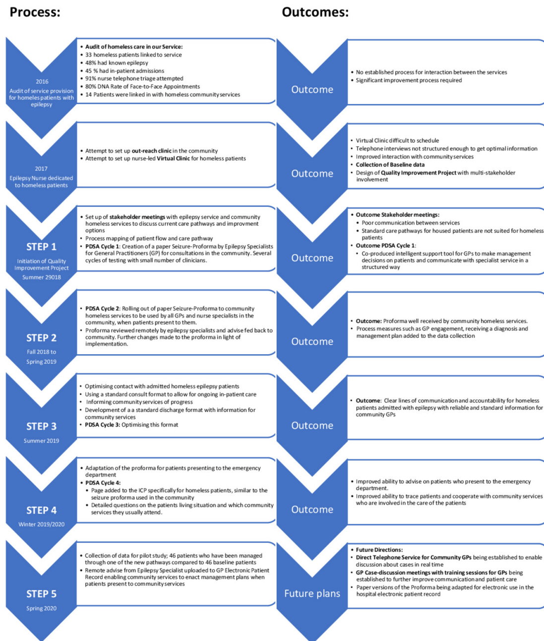
Figure 1 Timeline of processes and outcomes of our quality improvement project between 2016 to 2020. ICP, Integrated Care Pathway; PDSA, Plan–Do–Study–Act.

would be copied into the general discharge letter. Using the seizure pro forma to review homeless inpatients with seizures and communicating the outcomes to the community services we set up another PDSA cycle (PDSA 3) to try and optimise contact with community services for hospitalised patients.