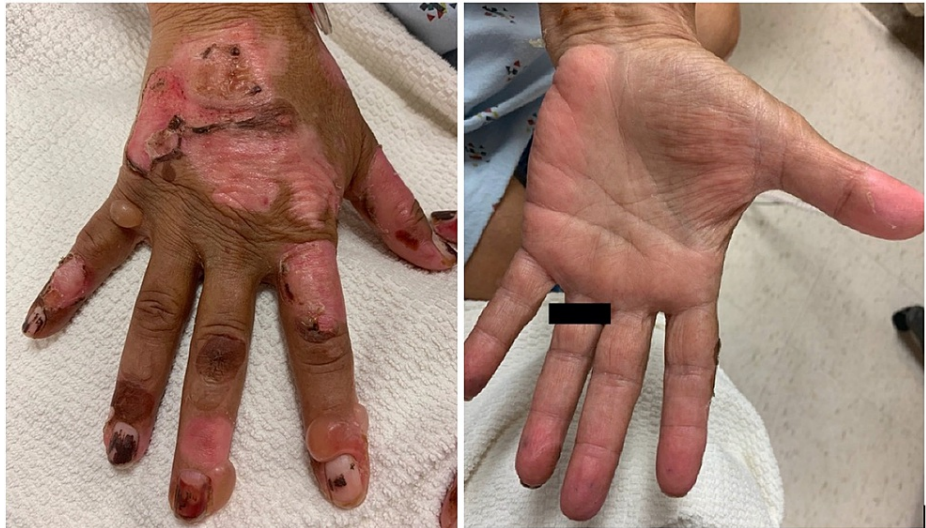
FIGURE 1: Image of the hand demonstrating multiple bullae with sparing of the palms.

A punch biopsy was performed which demonstrated thick homogeneous deposition of immunoglobulin (Ig)G, IgA, and fibrinogen within the walls of superficial dermal vessels (Figure 2). As the biopsy results were concerning for PCT, further workup was ordered which revealed elevated total porphyrins and uroporphyrins (Table 1). On examination, the patient's pigmentation was noted to be significantly darker compared to a photograph in her chart (Figure 3). Due to the patient's history of anemia and regular iron infusions every two weeks, previous iron studies were reviewed which showed a high ferritin level and total iron-binding capacity (Table 2). MRI of the liver showed iron overload and steatosis with a calculated iron concentration at 148 \mu\text{mol/g} (Figure 4). Genetic testing failed to demonstrate C282Y and H63D mutations in the HFE gene, supporting a diagnosis of secondary hemochromatosis.