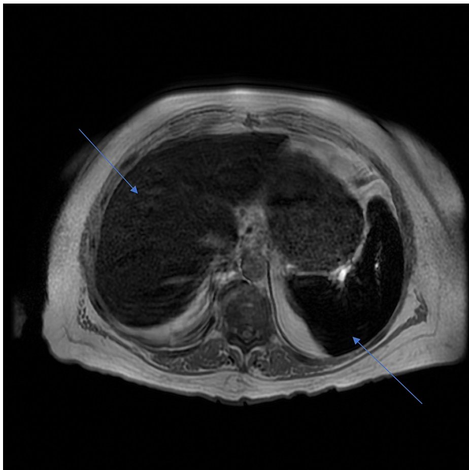
FIGURE 4: MRI of the abdomen showing iron overload in the liver and spleen. The calculated iron concentration in the liver measured 148 \mu\text{mol/g} (normal iron concentration in the liver is less than 36 \mu\text{mol/g} ).