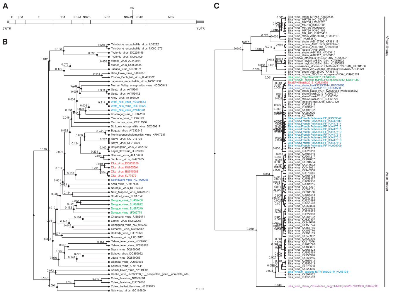
Figure 1 ZIKV genome divergence. (A) The ZIKV genome. (B) The ZIKV genome diverges from Flavivirus members. A phylogenetic tree was constructed using all gap-free sites from whole-genome sequences aligned by MAFFT ( http://mafft.cbrc.jp/alignment/software/ ) using a bootstrap of 1000 and neighbor joining. The same method was applied to (C) . (C) ZIKV strain evolution based on geographic area. Zika virus, ZIKA.

mechanisms distinct from these other viruses despite the similarity in disease symptoms exhibited by dengue, West Nile and ZIKV-infected individuals (Figure 1B).