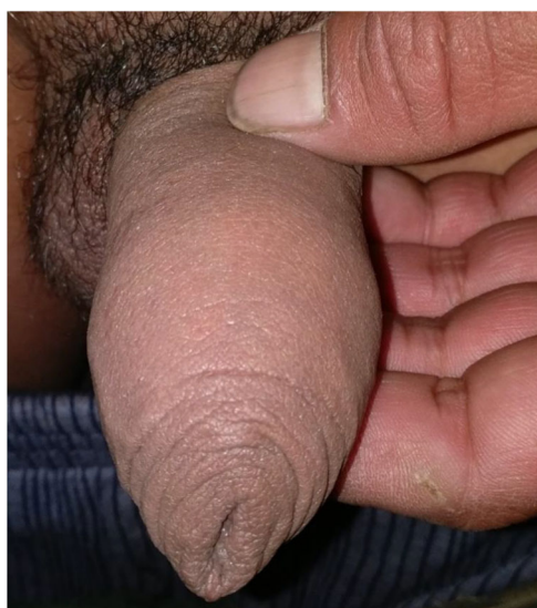
Fig. 2 Day 5 of the Treatment with reduction in swelling

case, there has been no recurrence till date, possibly due to extreme rare manifestation of chill blains. There was no evidence of erectile dysfunction associated along with this rare manifestation.