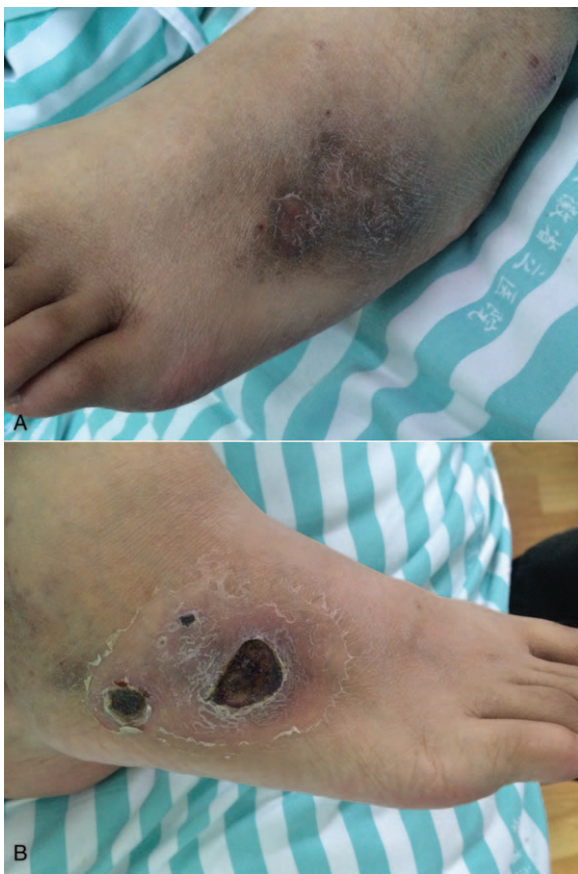
Figure 1. A. Old healed lesions in the left dorsum foot; B. New-onset skin lesions located on the right dorsum foot.

with gentamycin and ethacridine, all those symptoms were relieved (Fig. 1A). However, nearly half a month later, severe cutaneous lesions relapsed in the dorsum of his right foot, which has a large area of skin ulceration with swelling at the ulcerous margin. He was hospitalized for these hard healing skin lesions (Fig. 1B). The upper limbs, trunk and face membranes were free of lesions, with no other complains in this patient. He once suffered from Henoch-Schonlein purpura (HSP) 13 years ago when he was 9. A daily 25 mg predison was used to treat him for couple of weeks. Then he recovered well and no clear anaphylactogen was found at that time.