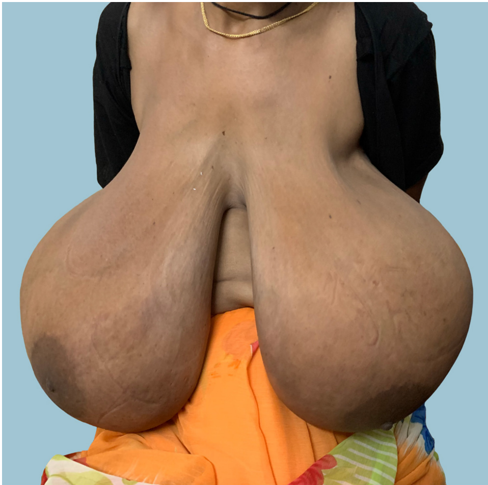
Picture 1. Bilateral gigantomastia.