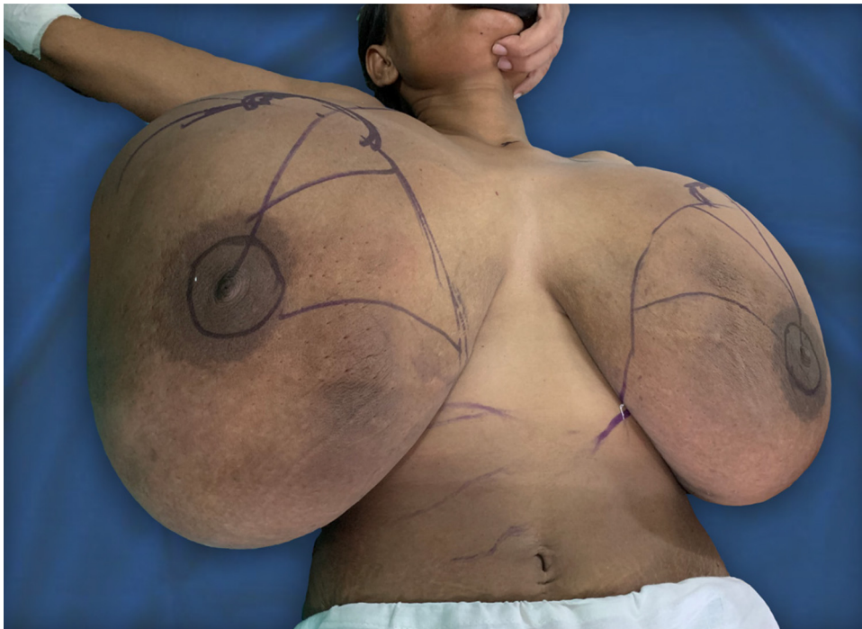
Picture 3. Pre-operative image of the patient.