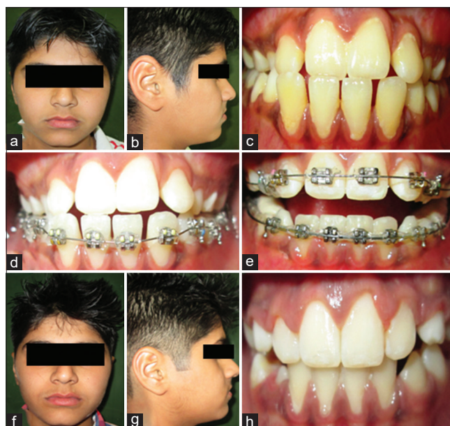
Figure 3: (a-c) Preoperative extraoral and intraoral photographs. (d and e) Intraoral frontal views showing two-by-six fixed orthodontic appliance. (f-h) Postoperative extraoral and intraoral pictures

For the correction of developing Class III malocclusion, appliances are categorized as follows: (a) functional