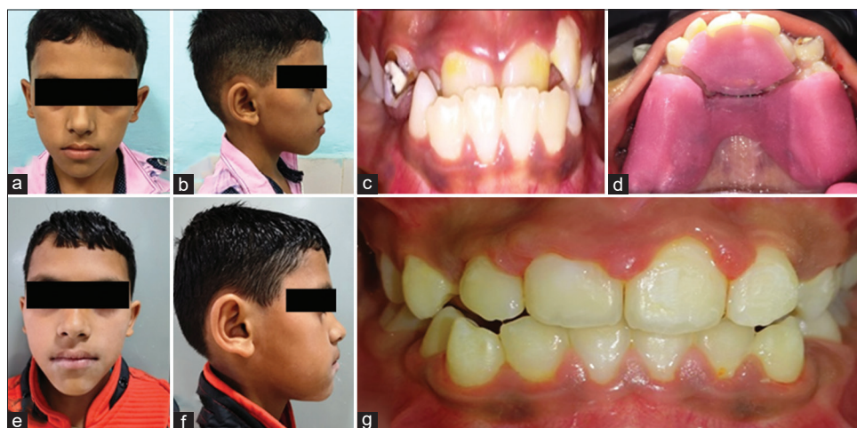
Figure 1: (a and b) Preoperative frontal and lateral extraoral profile. (c) Preoperative intraoral view. (d) Sagittal expansion appliance. (e and f) Postoperative frontal and lateral extraoral profile view. (g) Postoperative intraoral view

A child aged 6 years reported with inwardly placed upper front teeth. There was no family history of Class III malocclusion. The lower deciduous first molars were