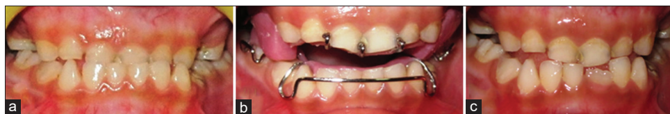
Figure 4: (a) Preoperative intraoral frontal view. (b) Reverse twin-block appliance. (c) Postoperative intraoral frontal view

maxilla, prognathic mandible, and concave profile) with no CR-CO deviation with supporting cephalometrics. Family history is mostly positive. Type 1 is further classified into Type 1a and Type 1b. Type 1a is also known as simple malocclusion (presence of functional shift with normally inclined anterior teeth). Type 1b is also called complex malocclusion, presents with abnormal dentoalveolar relations that imitate true Class III malocclusion. [6]