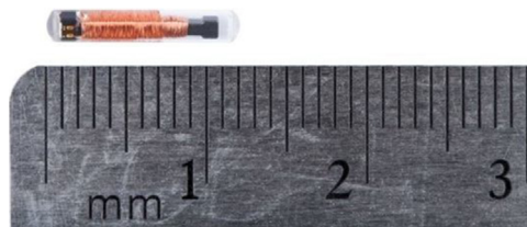
Fig. 1. A Biomark HPT12 (12.5 mm) PIT tag.

The current study developed and validated a flexible and non-invasive PIT tagging protocol for tropical freshwater fishes, using two Mekong River species – Striped catfish ( Pangasianodon hypophthalmus ) and Goldfin tinfoil barb ( Hypsibarbus malcolmi ) – as test cases. Striped catfish are pangasiid catfishes, which annually migrate to access spawning sites in several upstream locations on