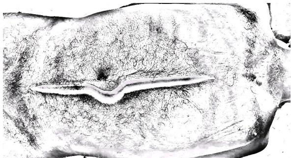
Figure 2 Skin incision from the xiphoid process to the symphysis pubis encircling the umbilicus.

omentum and trace the lesser curvature of the stomach downwards. Next, the stomach and the vascular attachments were cut and turned to the left to expose the lesser sac. Finally, the peritoneum was removed as far inferiorly as the attachment of the greater omentum. All other abdominal organs were dissected as per the conventional method. 16-20