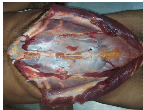
Figure 4 After removal of rectus abdominis, peritoneum intact.

expose and cut through the root and pulmonary ligament from above downwards close to the lung using a long blade knife. The lung was removed on each side and stored in a plastic bag to prevent it from drying. The heart was grossly examined for pathological changes, particularly for the pericardium and dilatation changes, and was finally removed.