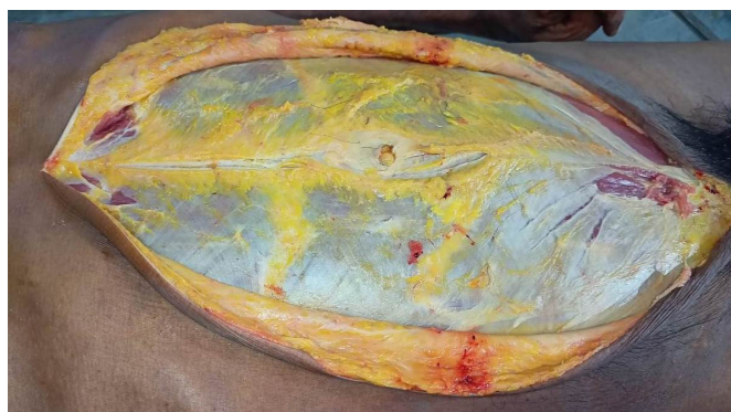
Figure 3 Skin incision deep through the subcutaneous tissue and fascial layers.

Once access was gained into the thoracic cavity, the heart and lungs were separated from the remaining parts of the mediastinum. The lung was pulled laterally from the mediastinum to