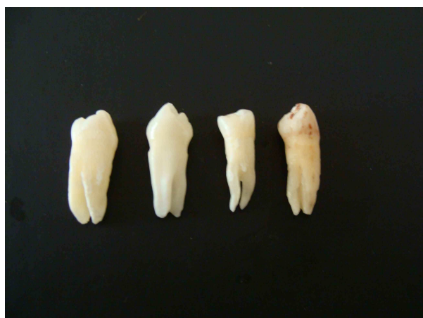
Figure 1. Two rooted mandibular first premolar teeth.

Canal Orifice: In the mandibular first premolar teeth one canal orifice was found in 122 teeth (88.40%) and two canal orifices were found in 16 teeth (11.59%)