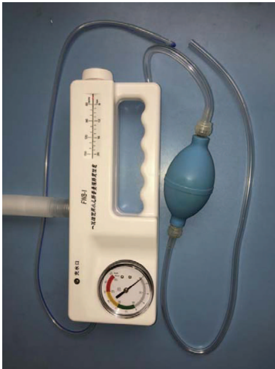
Figure 1. Photo of the apparatus of hydrostatic reduction.

in intussusception, and absence of blood flow in the intussusception.