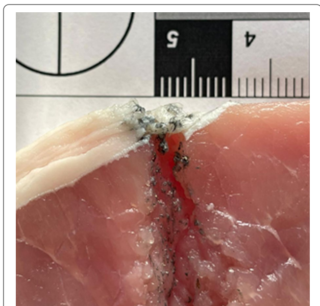
Fig. 2 Macroscopic cross-section of a contact shot wound channel. Random deposits of gunshot residue can be seen in the wound channel, but a clear ring corresponding to PMCT findings is missing from the outer end

shooting distance, being smallest in contact shots and largest in distant shots.