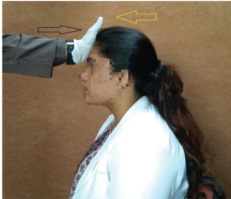
FIGURE 2: Steps involved in forehead against resistance (FAR).