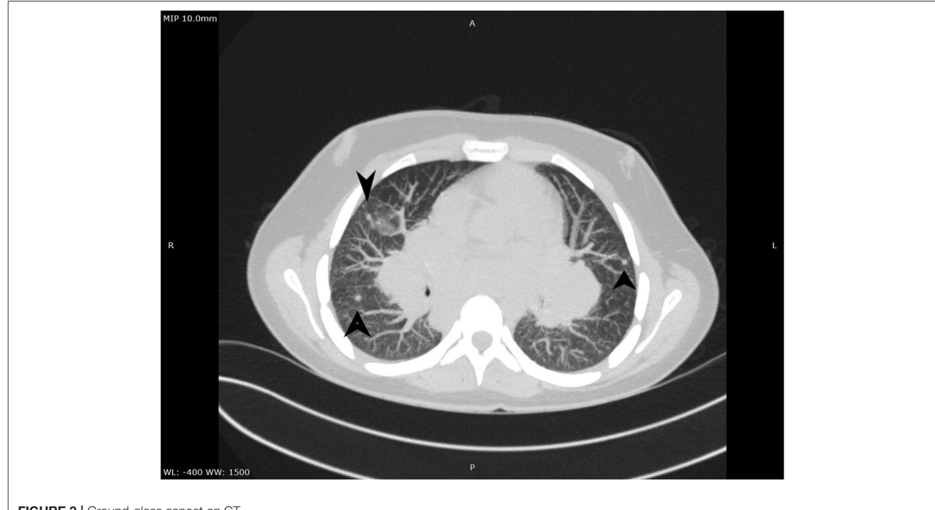
FIGURE 3 | Ground-glass aspect on CT.

This was treated according to the standard guidelines, using double-antibiotic regimen (amoxicillin and clarithromycin) that influences proton pump inhibitors. The elevated levels of urea