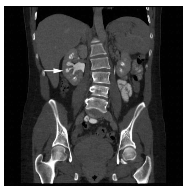
Figure 2 Computerized tomography urogram (post-contrast) coronal view demonstrating dilated medullary contrast-filled tubules and medullary calcifications (arrow). Note: Reprinted from Perm J. 18(2), Imam TH, Taur AS, Patail H, image diagnosis: medullary sponge kidney. e130-e131, doi:10.7812/TPP/13-145, copyright (2014), with permission from The Permanente Press. Available from: www.thepermanentejournal.org.<sup>7</sup>

Multi-detector computed tomography (MDCT) can accurately diagnose MSK comparable to IVU.<sup>13</sup> MDCT has a slightly lower sensitivity compared to IVU in regard to MSK, however studies show that the method is still a