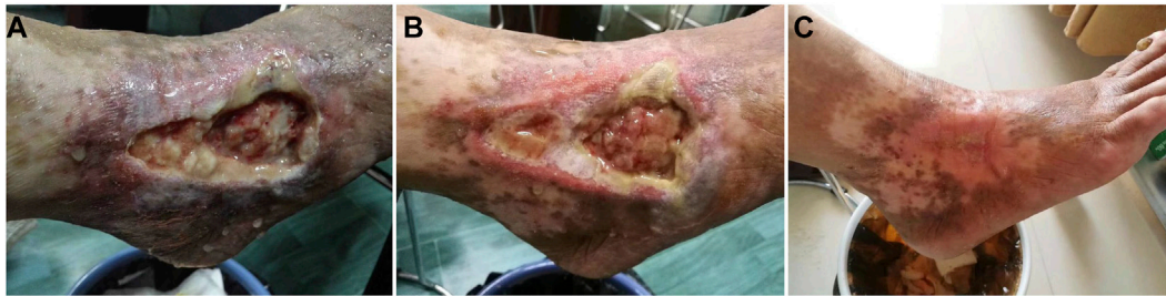
FIGURE 2 | Clinical reference pictures: (A): wound granulation tissue formation accounted for 40% of the total wound volume (B): wound granulation tissue formation accounted for 70% of the total wound volume (C): wound granulation tissue formation accounted for 100% of the total wound volume.