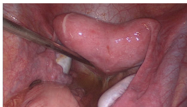
Figure 3. Laparoscopy confirmed the bicornuate uterus with a broad fundus and adhesions in the pouch of Douglas and uterosacral ligament.

VACTERL association has previously been reported to coexist with female genital malformation. Solomon BD reported 9 female patients with genitourinary anomalies among 89 VACTERL patients. Among the 9 patients, 5 had cloacal anomalies with 1