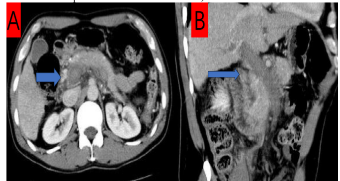
Fig 1A: portal vein-superior mesenteric vein extensive thrombosis; 1B: superior mesenteric vein thrombosis

upper abdomen, yellowing of the skin and sclera, and edema of the lower limbs. Blood examination showed that blood ammonia (56.8 μmol/L), alkaline phosphatase (365 IU/L), AST and ALT (154 IU/L and 165 IU/L) were significantly increased, while total bilirubin was 7.6 mg/dl (0.1-1.2 mg/dl) and direct bilirubin was 6.8 mg/dl (0.0-0.3 mg/dl). In addition, the patient's white blood cell count was also significantly increased, the platelet was 76 \times 10^9/L , D-dimer was elevated and prothrombin time (PT) was prolonged in patients (INR 2.1). The serum anti hepatitis A immunoglobulin M (IgM) antibody was high titer positive (repeated three times). The CT examination of the patient showed that the liver was mildly enlarged, and thrombus appeared in the main portal vein and superior mesenteric vein, with a small amount of