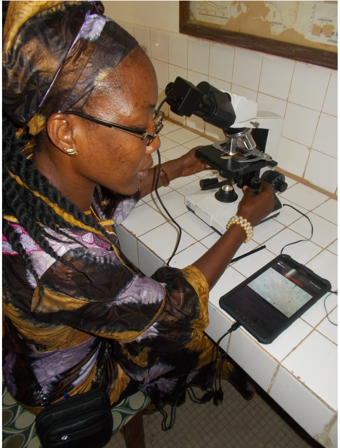
Fig 2. Digital imaging system for recording videos of microscopic images using an android tablet and external camera mounted onto the ocular tube of a microscope.

https://doi.org/10.1371/journal.pntd.0006664.g002