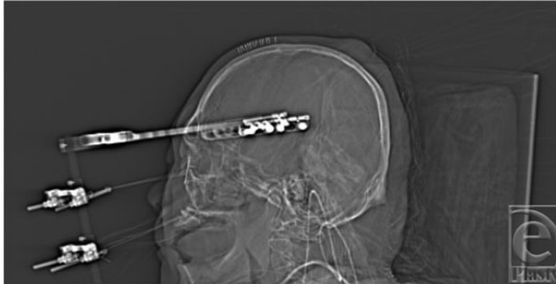
Figure 2. Sagittal image of a patient with RED device intact. RED indicates rigid external distraction.

patients with severe facial trauma often present with multiple concomitant injuries as a result of high-velocity trauma. These extensive injuries may necessitate the need for other, more emergent operative interventions that could delay or preclude the placement of a RED device. Notably, the articles did not provide a uniform recommendation for how long the RED device should be left intact for adequate bony healing. Figures 1 to 3 demonstrate the use of a RED device in a patient at our institution with panfacial fractures.