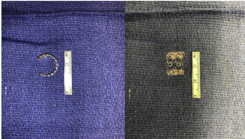
FIGURE 1. The bioresorbable plate was cut and molded intraoperatively according to the length and shape of the desired airway area.

The surgical approach and procedures performed in each patient are presented in Table 2 .