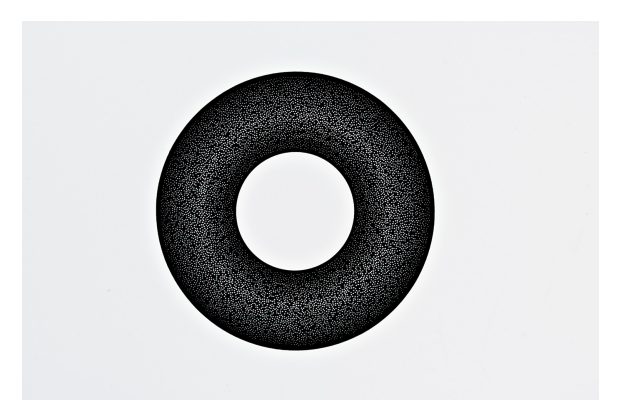
Figure 2 A schematic of the KAMRA inlay design.

Given that this is an additive procedure (ie, no corneal tissue is removed), it can be combined with refractive laser vision correction procedures where the eyes are made emmetropic – here the inlay is situated in a lamellar pocket at least 100 \mu m beneath the initial laser in situ keratomileusis (LASIK) flap.<sup>14</sup> Further, it can be implanted in previously pseudophakic eyes, which has been shown, albeit in a few cases, to produce a significant improvement in near acuity without affecting distance acuity.<sup>15</sup> Based on an eye model, it has been suggested that the best depth of focus is achieved