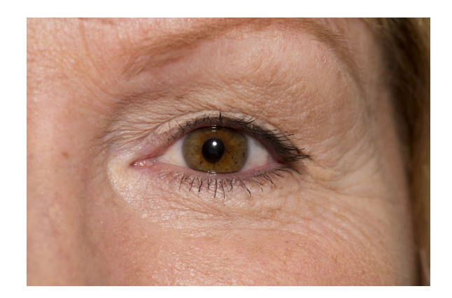
Figure 3 The KAMRA inlay inserted in a patient's cornea.