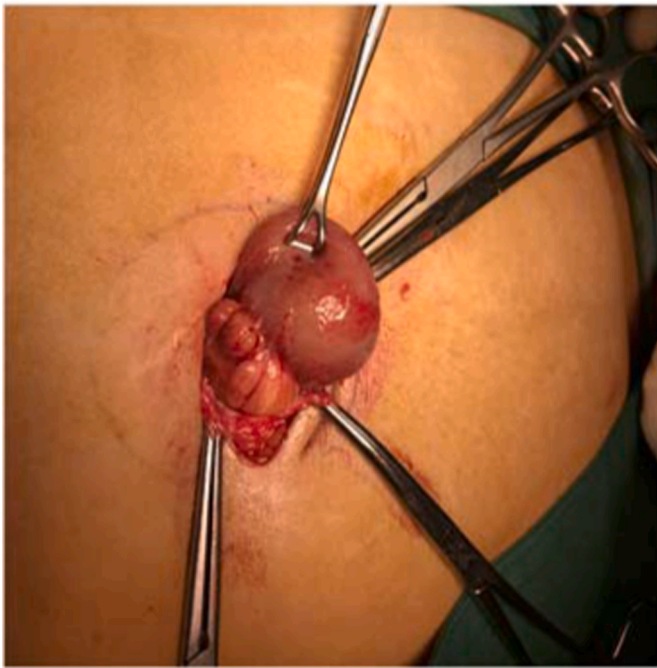
Fig. 4. A vital small bowel loop was found during surgery.