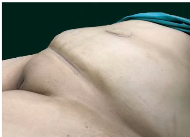
Fig. 1. Abdominal appearance was slightly distended with transverse scar in hypochondrium area, without bulging in wound scar, umbilicus or inguinal area.

Laboratory findings showed hemoglobin 13.4 g/dl (N: 14.0–16.0), leucocyte 7,500/\mu\text{l} (N: 4,000–11,000), thrombocyte 235,000/\mu\text{l} (N: 150,000–400,000), sodium 134 mmol/L (N: 138–146), chloride 104 mmol/L (N: 98–109), potassium 3.2 mmol/L (N: 3.5–4.9), urea 96 mg/dl (N: 19–44), creatinine 2.7 mg/dl (N: 0.62–1.17), blood sugar level 245 mg/dl. Reevaluation of abdominal plain x-ray showed small bowel dilatation that fixed in central abdomen, with air-fluid level, as shown in Fig. 2. Cesarean section was done extraperitoneally, hence the risk of adhesion was only in case with peritoneal torn. Abdominal CT scan was performed to explore the cause of small bowel obstruction. As shown in Fig. 3, both axial and sagittal plane showed small bowel dilatation and a loop of small bowel with air-fluid level within the abdominal wall in the umbilical area. The sagittal plane showed gall bladder stone. Re-anamnesis to find any symptomatic gallbladder stone found that the patient had mild chronic right upper quadrant pain. Palpation of the umbilicus felt there was smooth and soft ballooning mass below the umbilical crest, without bulging in inspection. Diagnosis was invisible incarcerated umbilical hernia and symptomatic gallbladder stone. Herniorrhaphy and laparoscopic cholecystectomy were performed. In surgery, there was a vital small bowel loop and was easily pushed back to