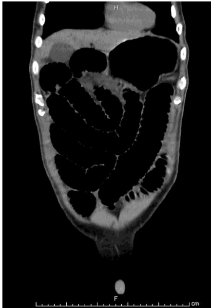
Fig. 2. CT coronal scan of case 2. Prominent dilated and air-filled images of the intestinal wall without apparent lesions were revealed.