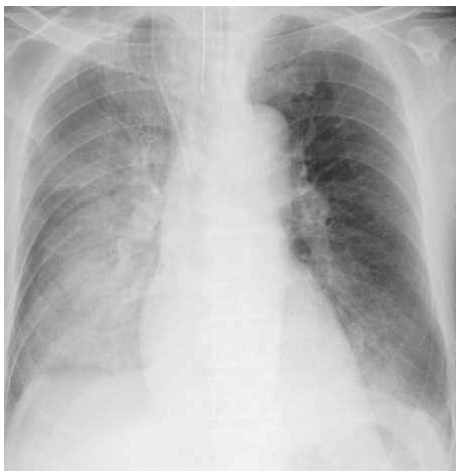
Figure 2. Chest X-ray indicated residue of the consolidation in both lungs on Day 11 of hospitalization, when the patient's respiratory status improved and mechanical ventilation was removed.

tient's respiratory status worsened. On day 4 of hospitalization, his PaO 2 level was 56 mmHg with the administration of 15 L O 2 by a non-rebreather mask and his blood pressure was 68/41 mmHg. He was transferred to the intensive care unit (ICU) with mechanical ventilation (Fig. 1B). After nor-adrenaline therapy proved ineffective against the patient's persistent hypotension, hydrocortisone [200 mg/day (50 mg/day of prednisolone equivalent)] was administered to maintain circulation. His blood pressure subsequently increased to the normal range and his respiratory status showed improvement. The corticosteroid dosage was increased to prednisolone (60 mg/day) on day 9 of hospitalization, and he was successfully weaned from mechanical ventilation on day 11 without additional immunosuppressive agents (Fig. 2).