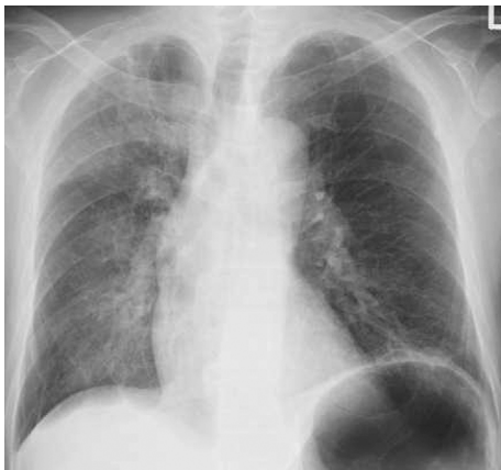
Figure 4. Chest X-ray on 52 day of hospitalization showed that the consolidation in the right lower lung field significantly improved. The patient was discharged from our hospital following these findings.

Infectious diseases should be excluded before the administration of corticosteroids. AFOP was mistakenly diagnosed