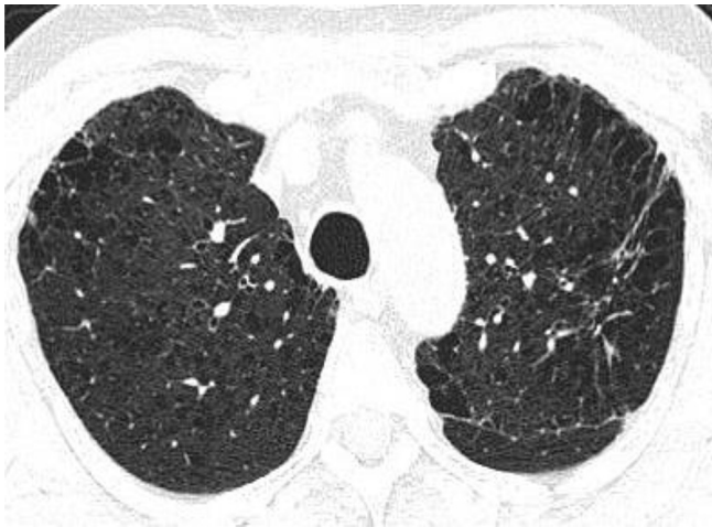
Figure 1. Centrilobular and paraseptal emphysematous changes in bilateral upper lobes and apical segment of left lower lobe. Also noted is a fibrotic lesion in the apicoposterior segment of the left upper lobe.