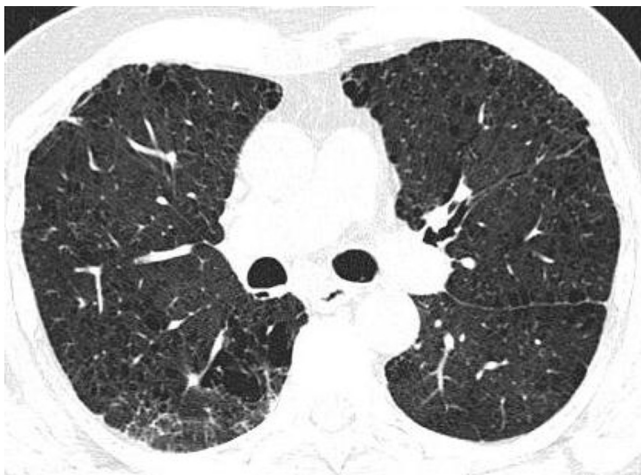
Figure 3. Reticular opacities, interlobular interstitial thickening with honeycombing, ground-glass opacity and emphysematous changes in bilateral lower lobes, right middle lobe and lingular segment of the left upper lobe.

Figure 2. Centrilobular and paraseptal emphysematous changes in bilateral upper lobes and apical segments of bilateral lower lobes. Also noted is subtle ground-glass opacity in the apical segment of the right lower lobe.