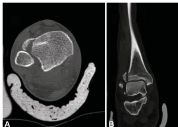
Fig. 2 Computed tomography of right ankle. (A) Axial view; (B) Sagittal view.

immobilization was used after the surgery, enabling early passive and active mobilization.