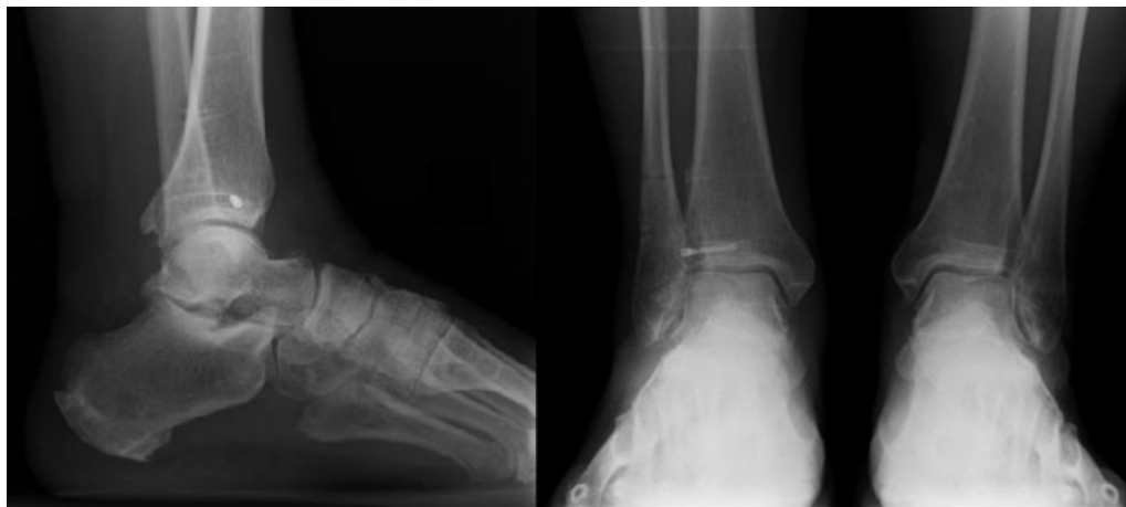
Fig. 5 Weight bearing radiograph at 6 months follow-up.

non-weight bearing cast or ankle braces. Displaced fractures over 2 mm should be managed surgically. 4,6