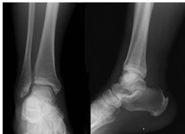
Fig. 1 Initial standard right ankle radiograph.

Under general anesthesia, in supine position and with a tourniquet applied to the right proximal thigh, the patient underwent anterior ankle arthroscopy through standard anteromedial and anterolateral portals. Extensive fibrosis was present. After debridement and loose body removal, fracture and syndesmotomy injury were both easily visualized. Fracture reduction was achieved under direct visualization and fixed with one 3.0 mm cannulated interfragmentary screw placed through the anterolateral portal. Syndesmotomy lesion was reduced and fixed with two percutaneous 4.5 mm transsyndesmotomy cortical screws. Arthroscopic exploration after fixation confirmed satisfactory reduction, which was also confirmed with fluoroscopy (→ Figs. 3 and 4 , video 1). No