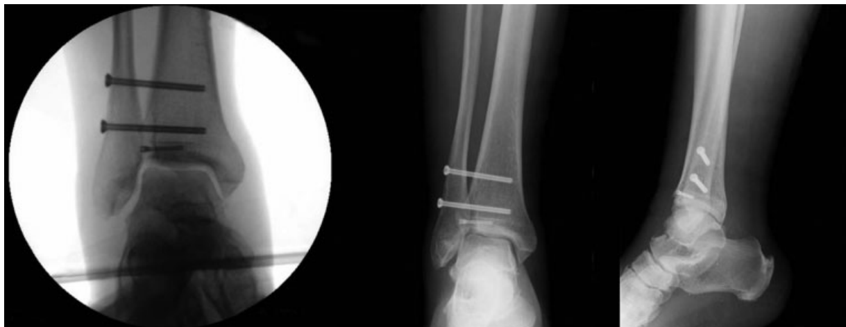
Fig. 4 Intraoperative fluoroscopy control – left; Postoperative radiograph – right.