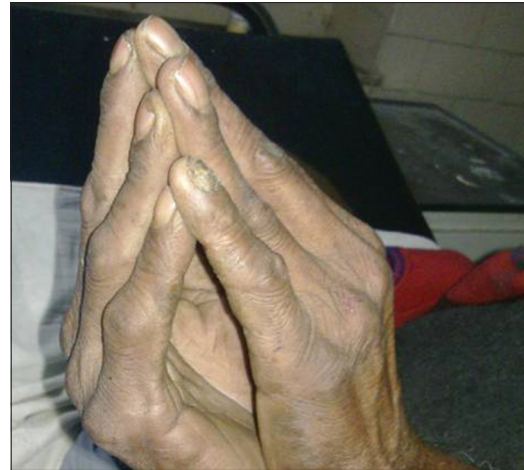
Figure 2: The preacher's sign involves the patient holding the hands opposed to one another vertically with elbows flexed and wrists extended. A positive sign is indicated by an inability of the patient to completely approximate the palmar surface of the digits

Since only few studies have been reported from India that compared rheumatic manifestations in a cohort of diabetic patients with control group, one such effort was made by Sarkar, et al. [4] The characteristics of diabetic foot disease are well documented in India; henceforth it would be appropriate to evaluate the problem of diabetic hand syndrome in this environment, and an attempt to characterize the relevance