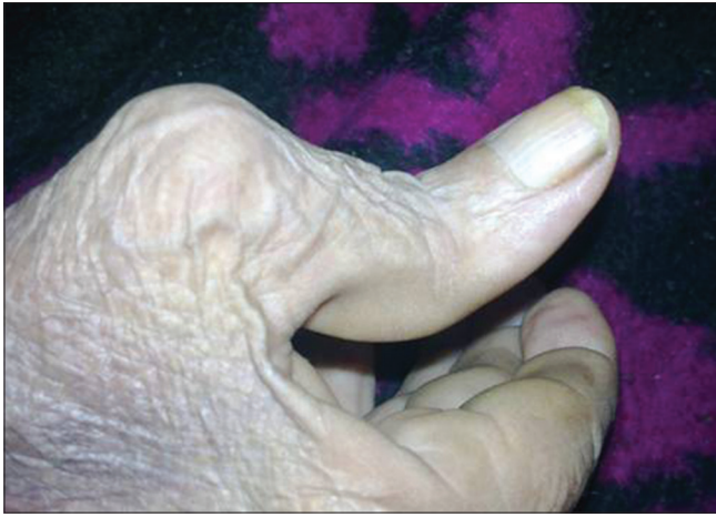
Figure 1: Diabetic cheiroarthropathy or stiff hand syndrome

neglected until hand deformity is severe enough to interfere with daily life.