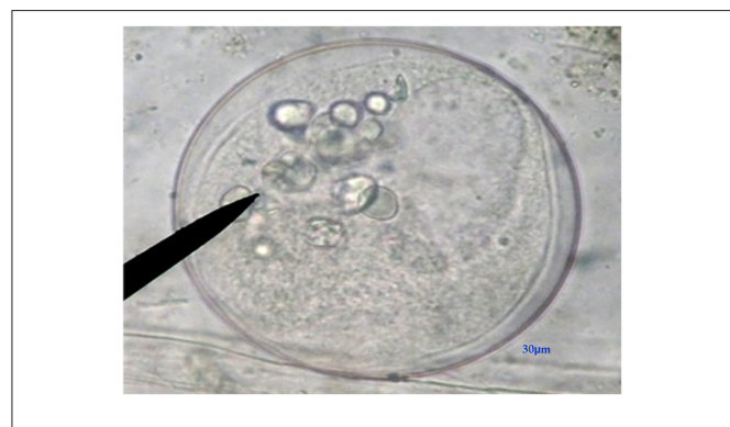
FIGURE 4 | Fresh fecal smear showing Buxtonella sulcata cyst (X40, Bar = 30 \,\mu m).

males and females with a p -value (p < 0.001). As illustrated in Table 6 , the highest positive rate was observed among female animals (51.28%). On the other hand, a positive rate in males was recorded (26.19%). Regarding the condition of animals, there was a statistically significant association between the frequency of positive samples and the condition of examined animals (diarrheic vs. non-diarrheic) as a potential risk factor (p < 0.0011). The majority of Cryptosporidium spp. were detected in diarrheic cattle calves (45.16%) than in non-diarrheic animals (15.78%). On the other hand, season and age were the variables that were not significantly associated with the occurrence of Cryptosporidium spp. In accordance with age as a potential individual variable factor, the occurrence of the infection in cattle calves aged >3 months 54.54% was higher than in the remaining age ranges. Regarding the potential influence of