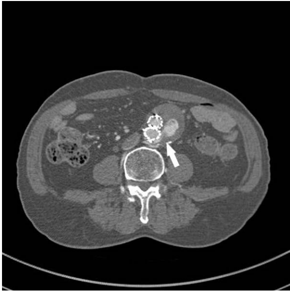
Figure 1. Axial view of two-year follow-up computed tomography angiography (CTA) taken 2 years after EVAR shows massive type II endoleak from lumbar arteries (arrow) with over 10mm increase in sac diameter.