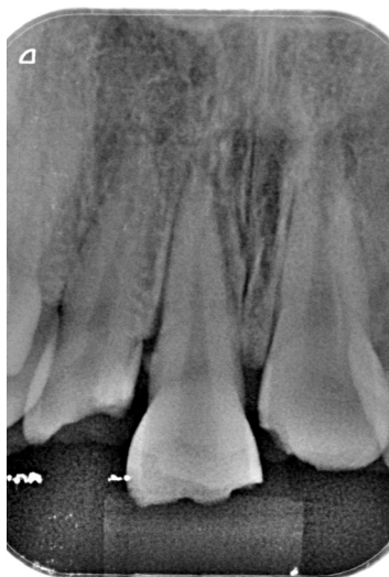
Fig. 2. Periapical X-ray view of the upper central incisors, showing widening of the periodontal ligament of the upper right central incisor secondary to extrusive luxation.