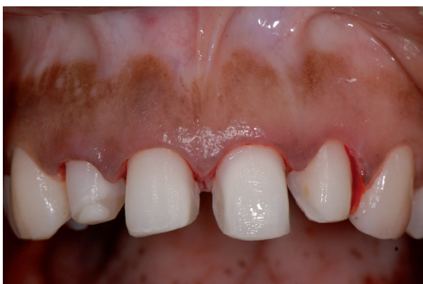
Fig. 5. Preparation for veneers on the four upper incisors.