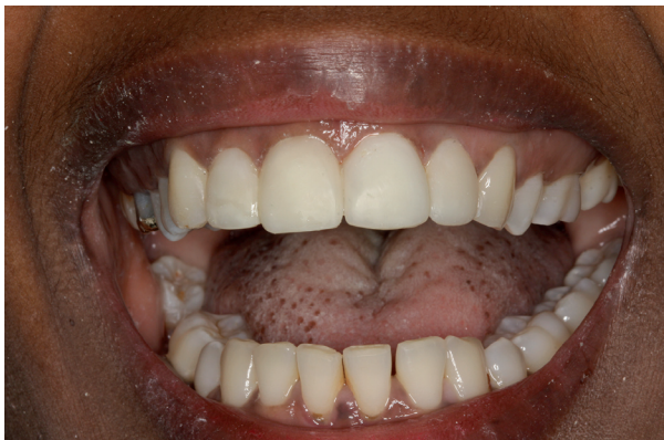
Fig. 4. Provisional composite veneers of the four upper incisors.