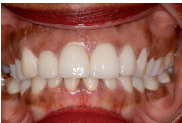
Fig. 6. Intraoral view of the porcelain veneers on the upper incisors.