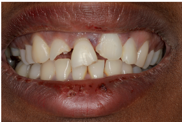
Fig. 1. Initial intraoral view showing the coronal fractures of the incisors and extrusive luxation of the upper right central incisor.

On the first visit and under local anesthesia, we repositioned the upper right central incisor within its socket, followed by splinting to the neighboring teeth with wire and composite material (5,6). Provisional reconstruction of the coronal fractures with composite was also carried