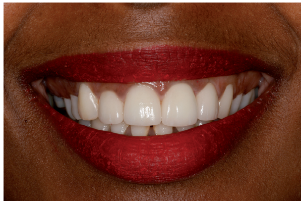
Fig. 7. Extraoral view of the porcelain veneers on the upper incisors.