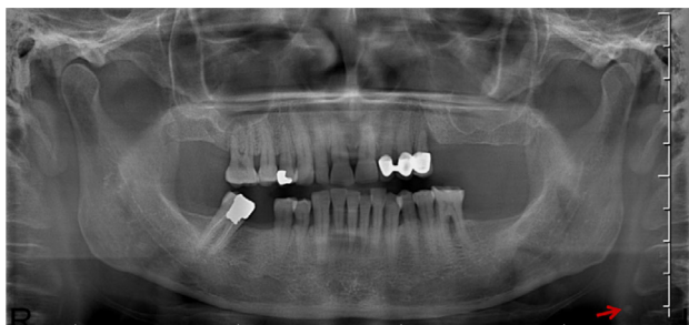
Fig. 1 – Image of a digital panoramic radiograph (DPR) showing a unilateral radiopacity of suspected carotid calcification on the left side (arrow).

continuous variables were demonstrated as mean \pm SD or median (min-max) percentiles where applicable.