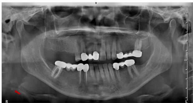
Fig. 2 – Image of a digital panoramic radiograph (DPR) showing a unilateral radiopacity of suspected carotid calcification on the right side (arrow).

A total of 1,450 DPRs were evaluated. Of those, 197 radiographs having imaging artefacts and 152 patients with missing clinical data were not included in the study (Figure 3). The study analyses were thus performed on 1,101 DPRs. The mean age of the study population was 42.1 \pm 15.5 years and 525 (47.7%) of all participants were female. Among those subjects, 34 (3.1%; 13 males, 21 females) had one or more radiopaque masses detected on the digital images. The most