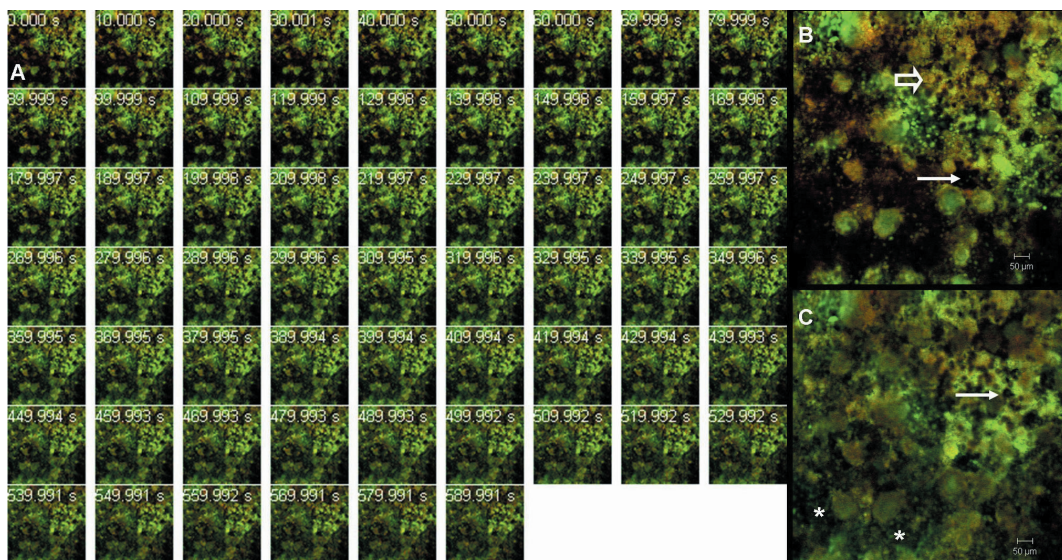
Figure 2- S. mutans biofilm on dentin surface after the Clearfil SE Bond primer application visualized by confocal laser scanning microscopy (CLSM). Images were recorded in real-time over 590 s. Viable bacteria are stained green and non-viable bacteria are stained yellowish/red color. Figure A shows image series of time-lapse scans according to the time (upper-left side of each scan). Figures B and C are higher magnification of image at zero time (Figure B) and at 590 s (Figure C), showing the presence of dead bacteria (open arrow) and non-stained (black) bubble-like structures within the biofilm architecture (arrow). Non-viable bacteria (red colonies) were visualized after the Clearfil SE Bond primer application (Figures A and B), nonetheless, there was no increase of these bacteria during 590 s and viable bacteria were observed at this time (Figure C). *Low-intensity noise that can be attributed to the fluorescence of the primer