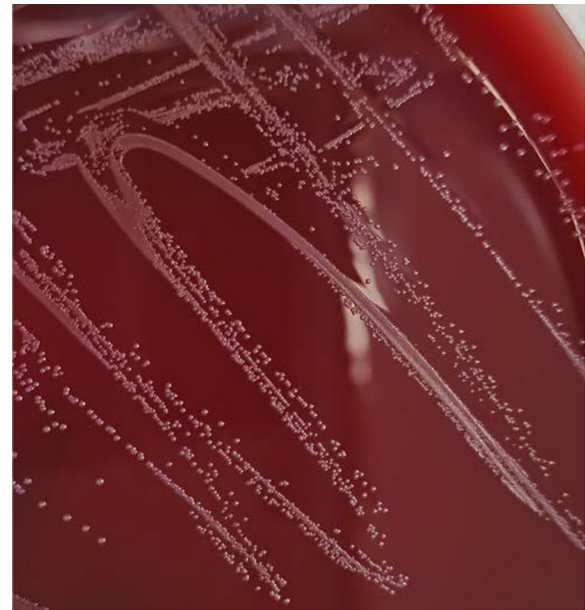
Fig. 1 Corynebacterium kroppenstedtii after isolated and subculture on sheep blood agar at 48 h

The breast pus samples of patients were collected and cultured on 5% sheep's blood agar plate (BAP), chocolate agar plate and McConkey agar plate (Guangzhou Detgerm Microbiological Science Ltd, China) and incubated at 35 °C and 5% CO 2 for 5 days. C. kroppenstedtii isolates showed grayish, translucent, slightly dry, and less than 0.5 mm in diameter on BAP with enrichment approximately 48–72 h (Fig. 1) and were identified by matrix-assisted laser desorption/ionization time-of-flight mass spectrometry (MALDI-TOF MS) using the Bruker Biotyper Compass library 10.0 [15, 19, 20]. The E-test (Wenzhou Kangtai Biotechnology, China) using a BAP incubated at 5% CO 2 and 35 °C for 24–48 h, which demonstrated susceptibility to vancomycin, linezolid,