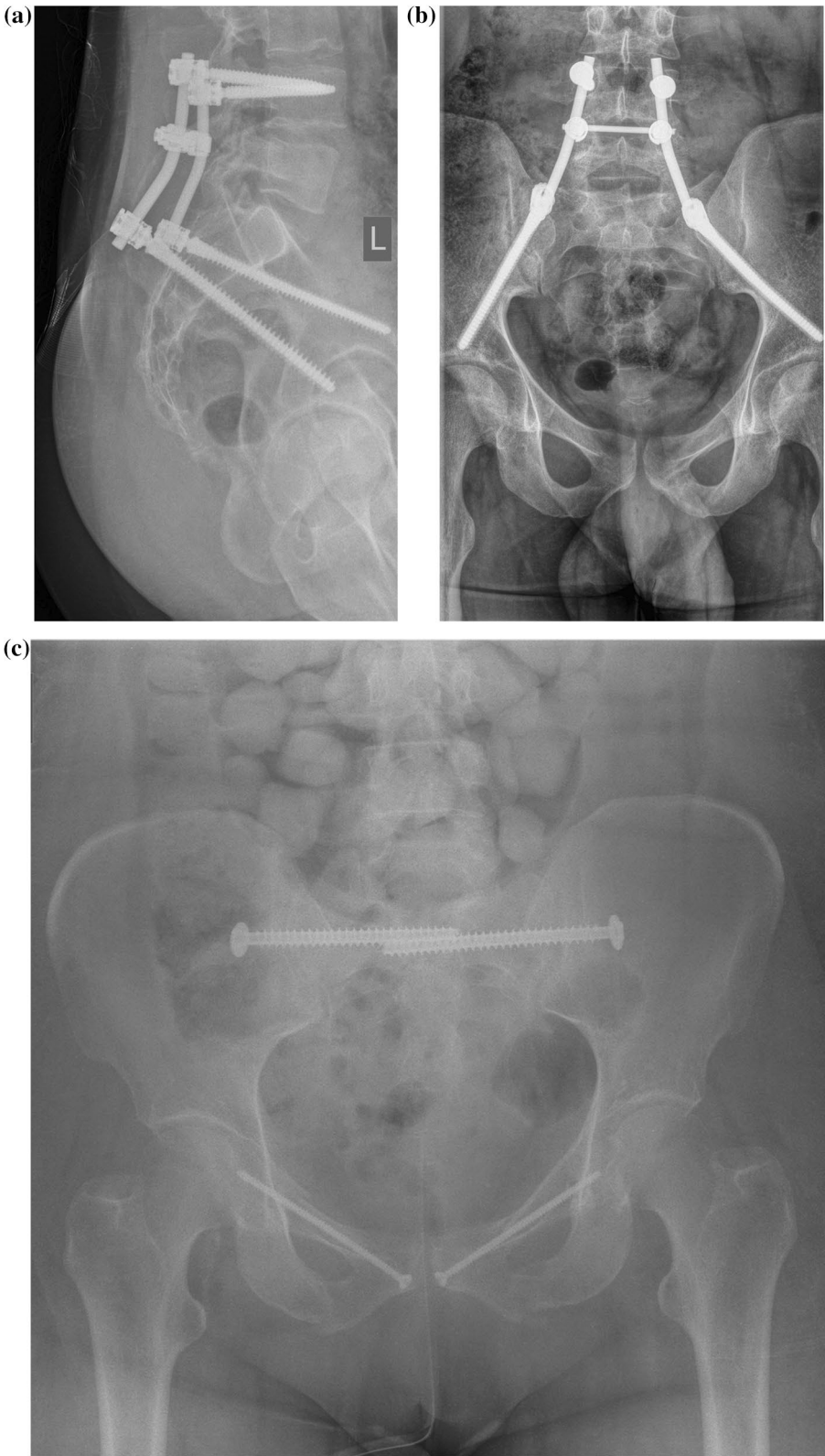
Figures 1 a and b Lumbopelvic implants inserted as described by Schildhauer. c ISF in combination with bilateral screwing of superior pubic ramus