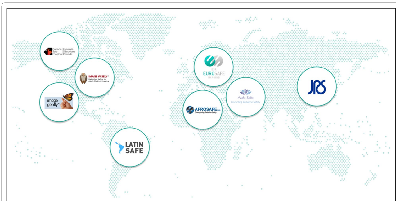
Fig. 2 International Society of Radiology Quality and Safety Alliance