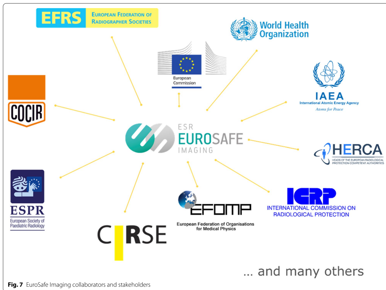
Fig. 7 EuroSafe Imaging collaborators and stakeholders

and issues relating to the implementation of the BSS Directive from an industry perspective.