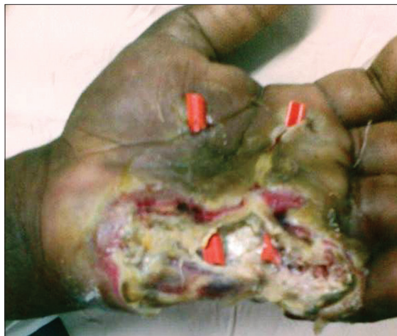
Figure 1: Necrotizing fasciitis in a 54-year-old man following a thorn prick injury and subsequent surgical intervention outside

Eleven (28%) patients had a history of antecedent trauma; however, no definite predisposing factors were identified