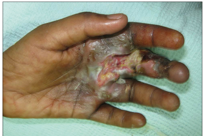
Figure 2: Features suggestive of flexor tenosynovitis of left middle finger in a 41-year-old lady who presented with spontaneous onset pain, redness and swelling

Out of 39 patients, comprehensive bacteriological data was available in only 25 patients among whom, polymicrobial infections were detected in 13 (52%), 9 (36%) had monomicrobial infection and 3 (12%) had a sterile culture. A total of 41 different bacteria among 13 different bacterial species were detected. Among the 41 bacterial isolates, Gram-positive bacteria constituted about 48.78%, and Gram-negative bacteria constituted about 51.21% of isolates. Among the Gram-negative isolates, Klebsiella and Pseudomonas aeruginosa species were found to be more common. Among Gram-positive isolates, Staphylococcus infections was more common (Details of the