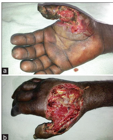
Figure 3: (a and b) Flexor pollicis longus tenosynovitis which evolved into necrotizing fasciitis in a 45 years male with poor glycemic control