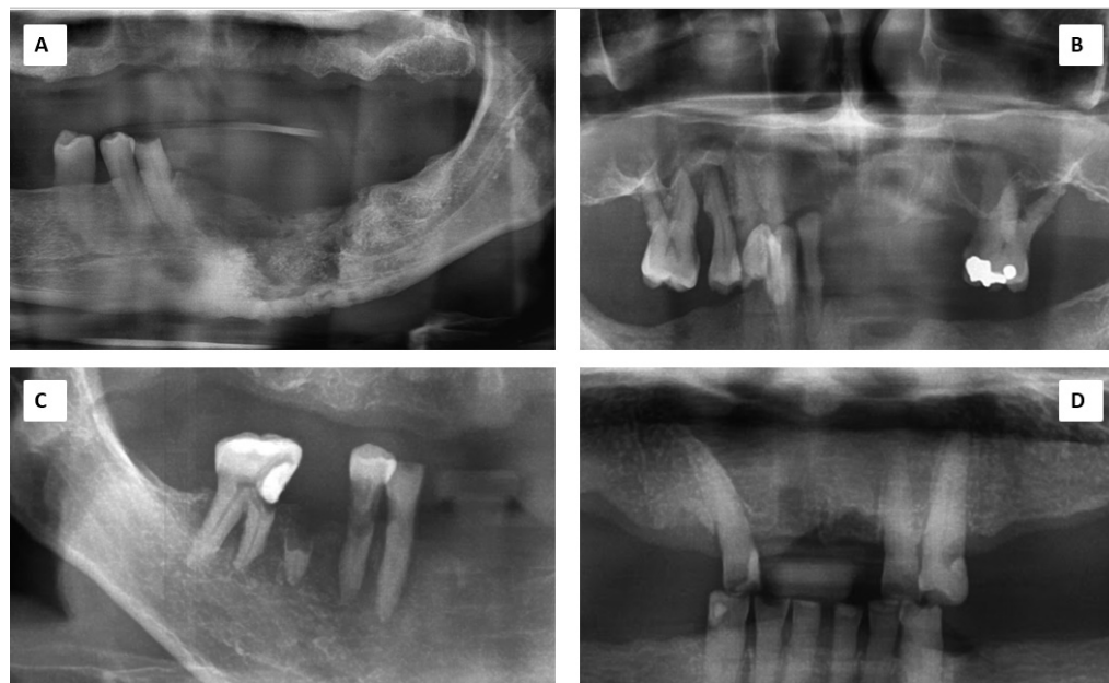
Figure 1. Orthopantomogram shows variety of presentations: (A): Case 1 showing osteolytic and sclerotic mandibular resorption; (B): Case 2 showing floating teeth indication severe maxillary bone resorption; (C): Case 6 showing severe bone resorption surrounding the 45, 46 and 47 teeth; (D): Case 3 showing normal bone trabeculae except at the extraction sockets on the anterior maxilla.

Case 1: A 55-year-old Malay male was diagnosed with a malignant giant cell tumour (GCT) of his right knee with metastasis to his lungs. The malignancy was diagnosed in 2018. An orthopantomogram showed an area of radiolucency at the edentulous area of 35 to 41 (Figure 1A) while the computed tomography (CT) scan showed features of an osteolytic lesion admixed with sclerosis. Sequestrectomy of the left mandible area was performed.