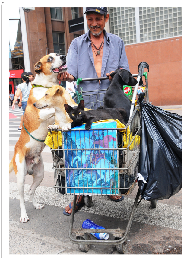
Figure 1 Human-animal bond. A homeless with his inseparable friends that were found abandoned in the streets of Porto Alegre, southern Brazil.

populations in tropical and subtropical regions around the world [5-7]. Furthermore, the impact of some of these diseases is disproportionally higher in developing countries such as Brazil, because the living conditions of the populations often favour the exposure to certain parasites, whose transmission may be associated with poor housing and sanitary conditions (Figure 2), as well as with inequities in the access to education and primary healthcare services.