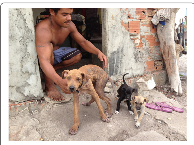
Figure 2 Poor living conditions. An owner and his dogs living in a poor rural community in Goiana, north-eastern Brazil, where visceral leishmaniosis is endemic. In poor rural communities people (as this man in the picture) are used to walking barefoot, which is a risk factor for bare feet-related diseases, such as cutaneous larva migrans and tungiasis.

Brazil is a country with continental dimensions (i.e., 8,515,767 km²), occupying most of the land area of South America and representing the largest economy in the region. Despite the persistent social and economic inequalities (e.g., unequal access to education, health care and sanitation, safe drinking water and decent housing), which have become the dark side of the Brazilian history, the importance of dogs and cats as pets, as well as the demand for high standard veterinary services, has increased over the last decades in Brazil. Impressively, according to the Associação Brasileira da Indústria de Produtos para Animais de Estimação (Abinpet), Brazil currently holds the world's second largest dog and cat populations, with over 37 million dogs and 21 million cats (http://abinpet.