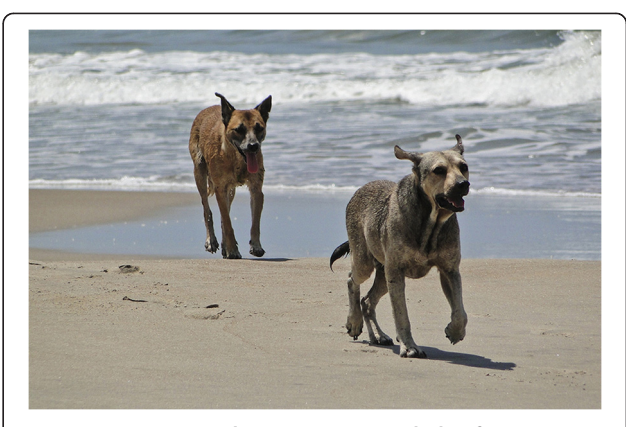
Figure 5 Environmental contamination with dog faeces. Stray dogs roaming freely in a beach in southern Brazil. Dog faeces are an important source of zoonotic parasites that may cause diseases such as cutaneous larva migrans .

Tapeworms are also an underestimated problem in Brazil and other South American countries. For instance, human cases of D. caninum have been described in Brazil [286-288]. Indeed, the high prevalence of D. caninum in dogs in Brazil (e.g., 45.7% in north-eastern and 36.8% in south-eastern Brazil) [32,36] is a consequence of the high prevalence of flea and lice infestations reported in different regions of the country [18,28,30,32,35] and indicates a