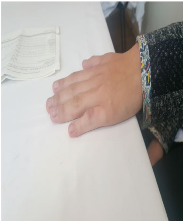
Fig. 5 Camptodactyly of the right little finger 8 months after surgery (dorsal view).

no continuity of the normal tendon between the muscle belly and bony insertion. The authors suggested that the tenodesis effect of the abnormal tendon of the flexor digitorum superficialis is considered to play an important role in the incidence of the camptodactyly.