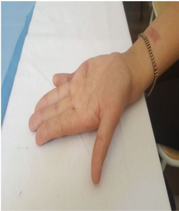
Fig. 4 Camptodactyly of the right little finger 3 months after surgery (palmar view).