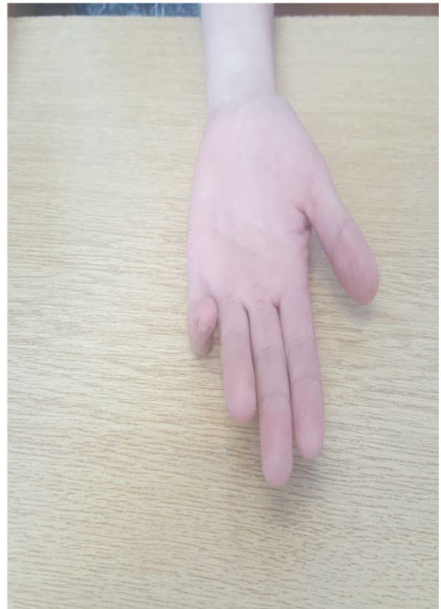
Fig. 2 Camptodactyly with contracture of the proximal interphalangeal joint more than 110 degrees (palmar view).

supports our conclusion. Furthermore, capsulotomy in the PIP joint was performed to improve flexion contracture of the PIP joint, and the skin defect created in the palmar surface of the PIP joint after extension of the finger was simultaneously concealed by full-thickness skin graft that was obtained from the front of the right forearm. To prevent the recurrence of the deformity, we applied dynamic extension splint onto the operated finger. We followed the case for over a year after the intervention, and it presented with excellent results (→ Figs. 3–6).