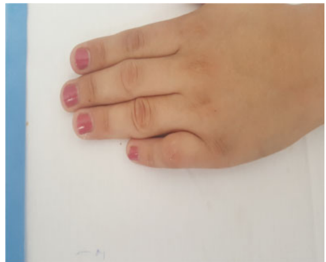
Fig. 3 Camptodactyly of the right little finger 3 months after surgery (dorsal view).

Similar to our study, Hoogbergen et al 16 reported the case of a 20-year-old man with a progressive flexion contracture