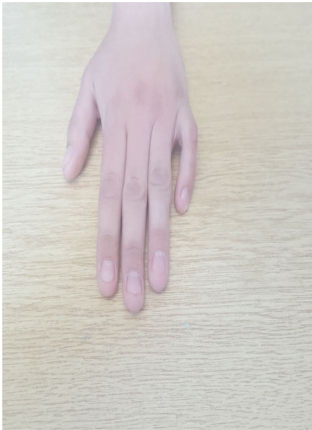
Fig. 1 Camptodactyly (dorsal view).