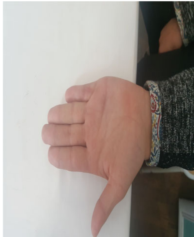
Fig. 6 Camptodactyly of the right little finger 8 months after surgery (palmar view).

no continuity of the normal tendon between the muscle belly and bony insertion. The authors suggested that the tenodesis effect of the abnormal tendon of the flexor digitorum superficialis is considered to play an important role in the incidence of the camptodactyly.