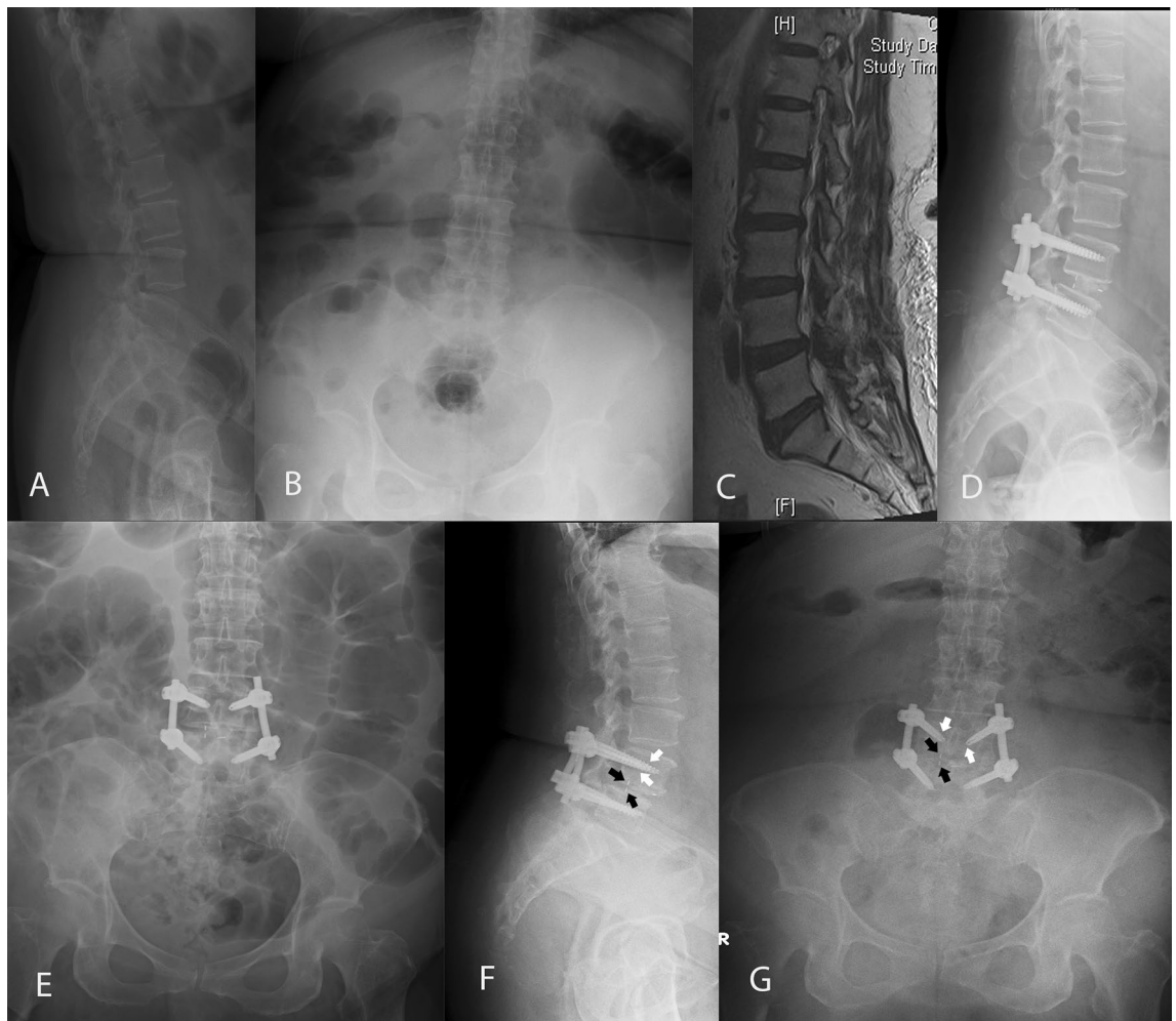
Figure 1. A patient was diagnosed preoperatively with degenerative spondylolisthesis and lumbar spinal stenosis at L4-5 level, and underwent minimally invasive transforaminal lumbar interbody fusion (MIS-TLIF). Radiographic images (A,B) and MRI (C) were taken preoperatively. The immediate post-operative lumbar spine lateral view (D) and lumbar antero-posterior view (E) are shown. Cage subsidence (black arrow) and screw halo sign (white arrow) were seen on the last follow-up images (F,G).

Clinical functioning. Functional data for clinical outcomes were evaluated using visual analog scale (VAS) to assess lower back pain, leg pain, soreness, and the Oswestry Disability Index (ODI). The VAS evaluations were done at pre-operation, post-operation (3 days after surgery), and 6-months follow-up. The ODI assessments were done at pre-operation and 6-months follow-up.