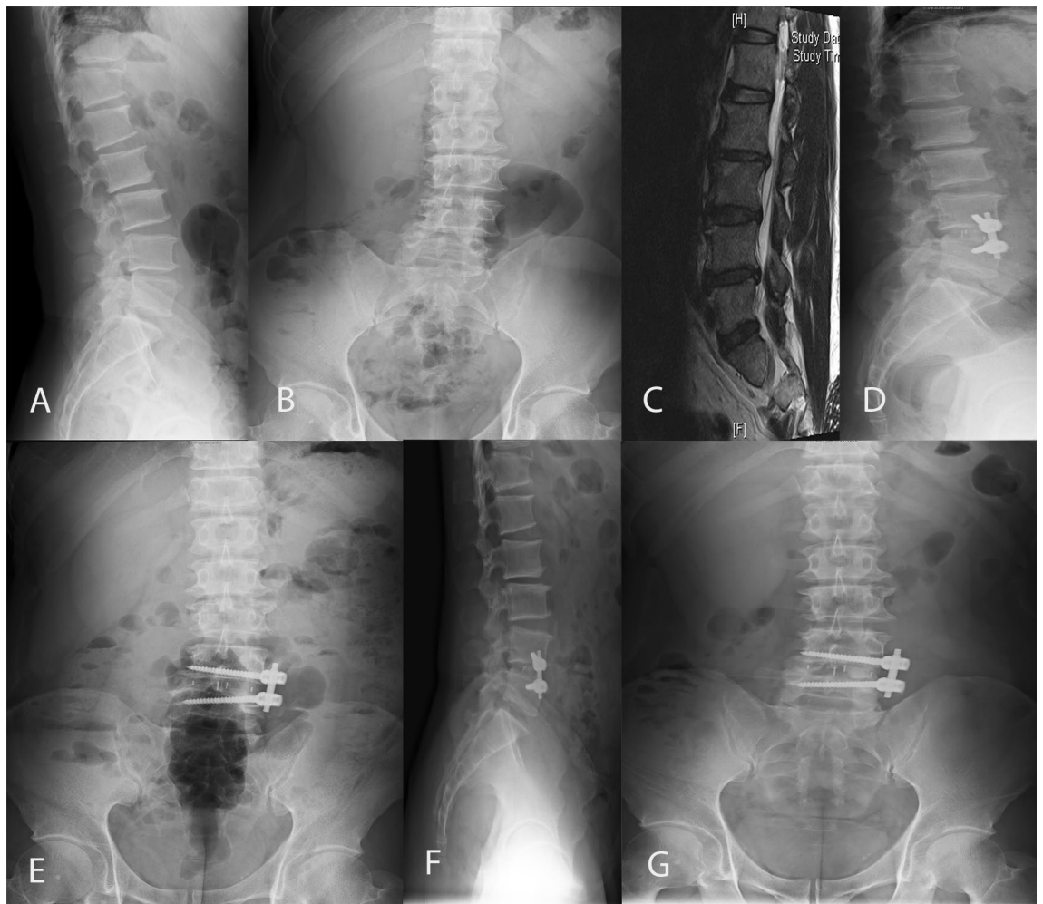
Figure 2. A patient was diagnosed with degenerative spondylolisthesis and lumbar spinal stenosis at L4-5 level, as shown on lumbar spine lateral view (A), lumbar antero-posterior view (B), and T2-weighted MR image (C). He received oblique lumbar interbody fusion (OLIF) at L4-L5 with lumbar spine lateral view (D) and lumbar antero-posterior view images (E) taken immediately after the surgery. Follow-up images (F,G) were taken at the last follow-up.