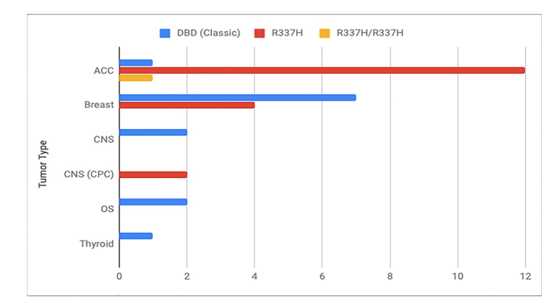
Fig 3. Graphic showing the differences between the tumor spectrum observed in carriers of the DBD variants, R337H variant and R337H homozygous proband. ACC, adrenocortical carcinoma; CNS, central nervous system; CPC, choroid plexus carcinoma; DBD, DNA binding domain; OS, osteosarcoma.

these authors did not restrict their recruitment to patients fulfilling Chompret criteria [25]. Second, results from the present analysis, in which overall TP53 germline PV detection rate in Chompret criteria fulfilling probands was lower than expected from previous studies, may suggest that a different set of pathogenic variants, not yet mapped (i.e. located in intronic or regulatory regions of TP53 ) may be associated with the LFS phenotype in this particular region. It is also possible that PV in other, yet unidentified genes are associated with the LFS phenotype, accounting for the "missing heritability" of more than 85% observed here [32, 33]. An important limitation of the present study, that must be accounted for when analyzing the results is this study, is that a significant proportion of data on genetic testing were obtained retrospectively and with different variant detection strategies. Thus, further analyses on a prospectively recruited cohort of probands fulfilling Chompret criteria and then, clinical assessment of families carrying either DBD PV or R337H will be important to confirm these findings. Expanding