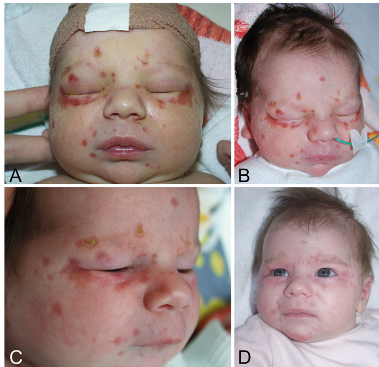
Figure 1 Skin lesions and annular erythema. Pustular lesions and annular erythema, partly with central lightening, yellowish, crusted plaques or slight scaling on the skin, exclusively in the face and on the forehead on the second day (A and B), after one month (C), and after three months (D).

well as rhythmic occipital delta activity on the left could be detected while no typical epileptic discharges occurred. A lumbar puncture showed no sign of infection, with a normal protein and white blood count. In particular, HSV-PCR was negative. Anticonvulsive therapy with phenobarbital was initiated but seizures could only be controlled after adding phenytoin. A diffusion-weighted magnetic resonance imaging was performed on the 3 rd day of life, revealing multiple ischemic brain areas in the distribution of the middle and posterior cerebral artery on the left side (Figure 2A-C).