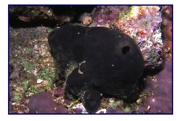
Figure 3. Underwater photograph of the Red Sea sponge Hemimycale arabica.