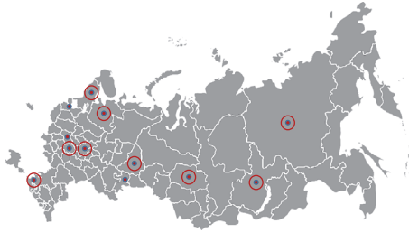
FIGURE 2: Geographic distribution of incidence reports and prevalence studies on CD in Russia. Small circles indicate that the data were only obtained from the regional center. Rounded circles indicate that the data were collected from several locations within the region. See Tables 2 and 3 for the results of these studies.

(0.38%) with the 1 : 5 ratio of typical to atypical CD forms [28]. According to the Pediatric Research Institute of the Republic of Uzbekistan (Tashkent region) the CD incidence was 1 : 366 (0.27%) [29].