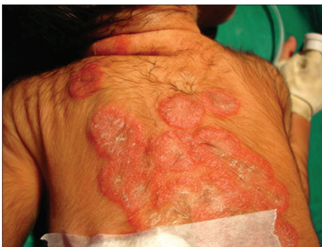
Figure 1: Erythematous annular lesions on the back of the neonate

hyperkeratotic and acanthotic epidermis with the presence of tubular structures in the stratum corneum suggestive of fungal hyphae. The dermis was unremarkable. A Periodic Acid Schiff