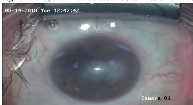
Figure 1. Preoperative anterior segment of the eye

Ocular examination on admission day to hospital revealed patients best uncorrected distance visual acuity (UDVA) to be light perception on patient RE (right eye) and 1.0 with out any correction LE (left eye). Results on patient slit lamp revealed on the right eye corneal edema with a central leukoma, with a complicated cataract and partial seclusion of pupil and no pathological findings on left eye. Patients pupil size were equals. Patient ocular movements were normal in all gazes. Intraocular pressure (IOP) was also normal. Examination of the left eye was normal. The vitreous was quiet and retinal vessels were of normal caliber. Details on the founds of right eye were impossible to asses due the changes in anterior segment. We performed ultrasound examination and we