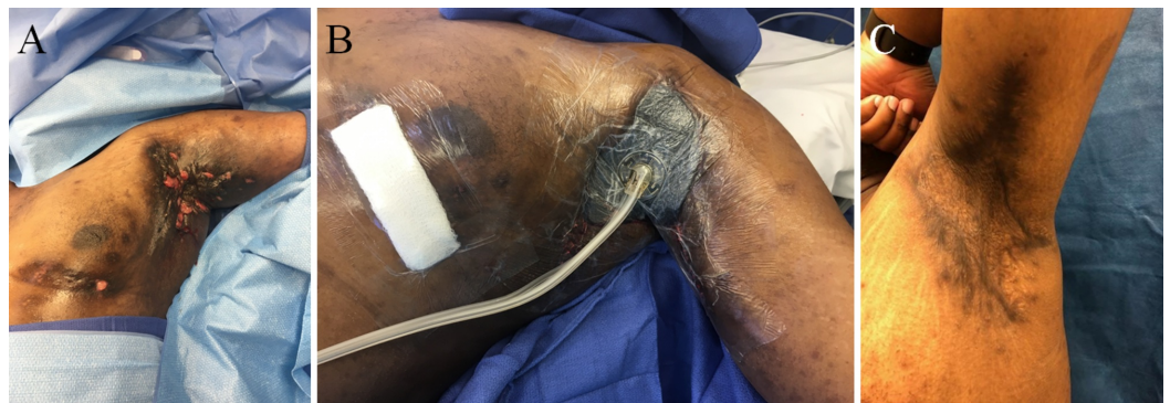
FIGURE 3: Patient with severe bilateral axillary disease with left chest involvement (A) who underwent local excision, tissue advancement, and negative pressure wound therapy with instillation and dwell time (NPTWi-d) placement (B); postoperative 21 months with no local disease recurrence following successful autologous skin grafting (C)